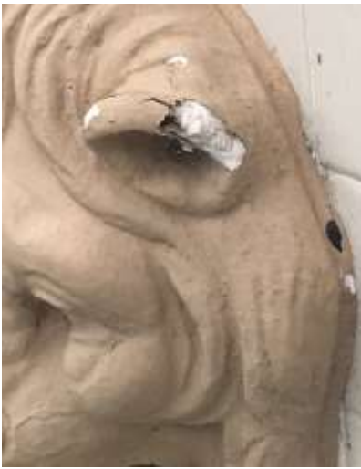
They dropped something on the lion's head and broke plaster/paint off as well as part of the ear. You see dripped paint here as well.