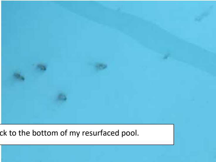
Paint stuck to the bottom of my resurfaced pool.