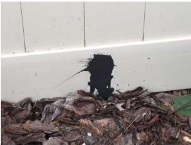
They got paint on the white vinyl fence. No regard for my property which is nice on purpose.